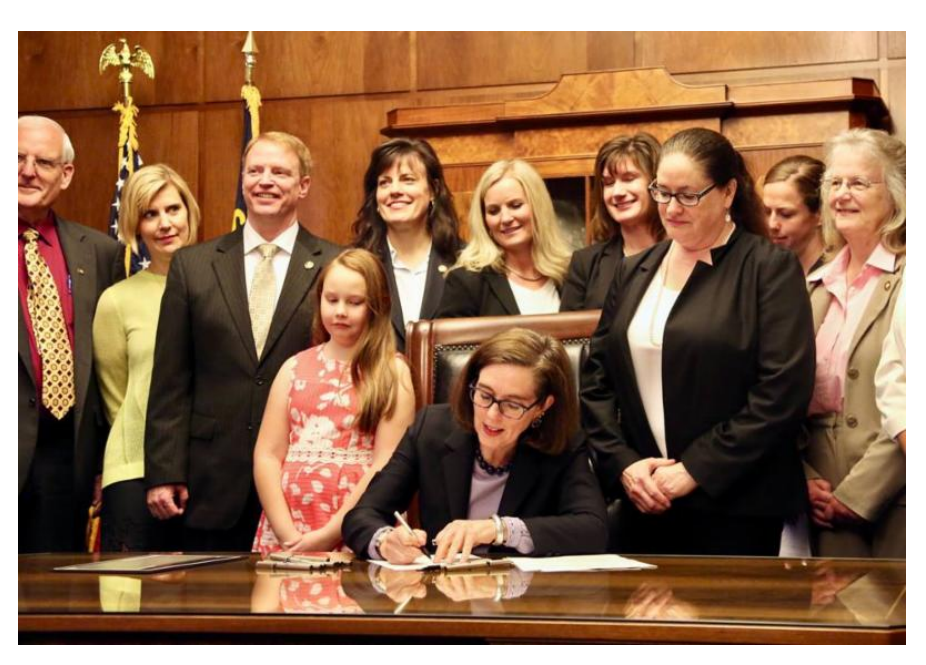
Oregon Governor Kate Brown signs the Oregon Equal Pay Act on June 1, 2017.

Oregon is the latest state to sign pay equity into law.